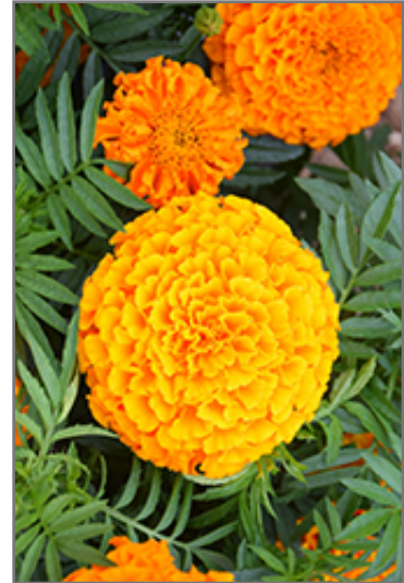
Taishan Orange Marigold flowers

Taishan Orange Marigold is a fine choice for the garden, but it is also a good selection for planting in outdoor pots and containers. It is often used as a 'filler' in the 'spiller-thriller-filler' container combination, providing a mass of flowers against which the larger thriller plants stand out. Note that when growing plants in outdoor containers and baskets, they may require more frequent waterings than they would in the yard or garden.