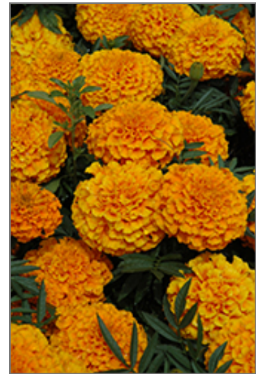
Taishan Orange Marigold flowers