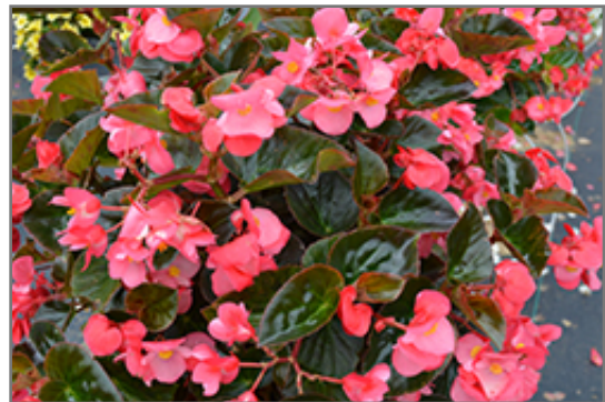
Big Rose Bronze Leaf Begonia flowers