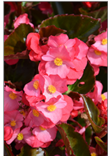
Big Rose Bronze Leaf Begonia flowers

This is a high maintenance plant that will require regular care and upkeep, and usually looks its best without pruning, although it will tolerate pruning. Deer don't particularly care for this plant and will usually leave it alone in favor of tastier treats. Gardeners should be aware of the following characteristic(s) that may warrant special consideration;