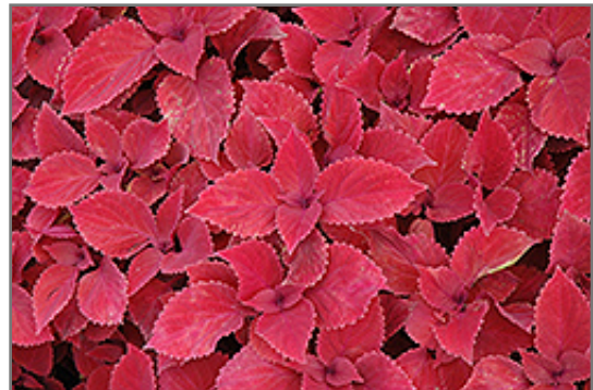
Redhead Coleus foliage