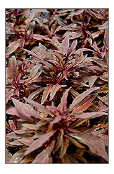
ColorBlaze Velvet Mocha Coleus foliage

ColorBlaze Velvet Mocha Coleus will grow to be about 3 feet tall at maturity, with a spread of 24 inches. When grown in masses or used as a bedding plant, individual plants should be spaced approximately 20 inches apart. Although it's not a true annual, this fast-growing plant can be expected to behave as an annual in our climate if left outdoors over the winter, usually needing replacement the following year. As such, gardeners should take into consideration that it will perform differently than it would in its native habitat.