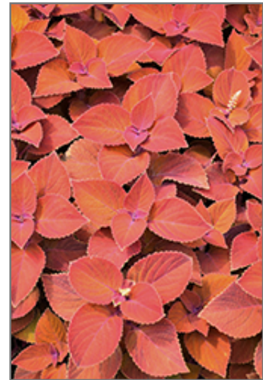
ColorBlaze Sedona Sunset Coleus foliage