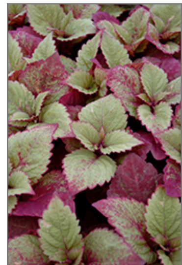
ColorBlaze Royal Glissade Coleus foliage