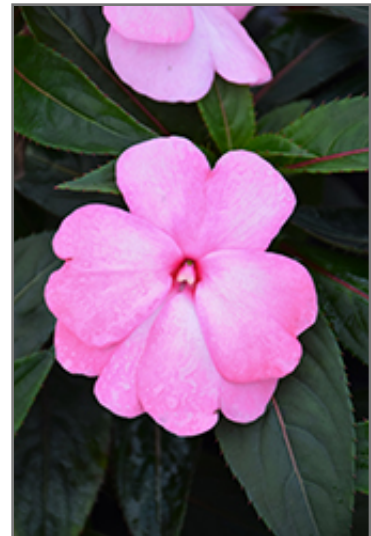
Super Sonic Pastel Pink New Guinea Impatiens flowers