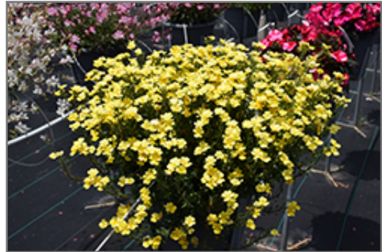
Sunsatia Lemon Nemesis in bloom