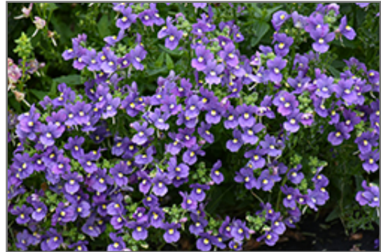
Bluebird Nemesia flowers