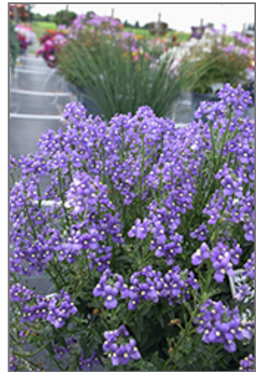
Bluebird Nemesia flowers