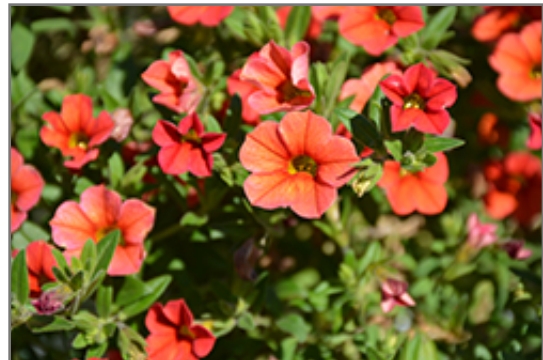
Can-Can Orange Calibrachoa flowers

This plant will require occasional maintenance and upkeep. Trim off the flower heads after they fade and die to encourage more blooms late into the season. It is a good choice for attracting bees and hummingbirds to your yard, but is not particularly attractive to deer who tend to leave it alone in favor of tastier treats. It has no significant negative characteristics.