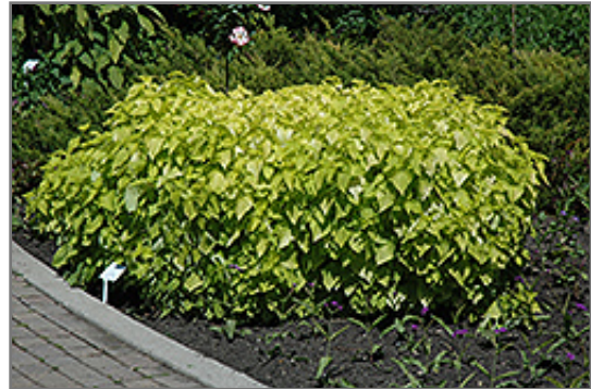
Golden Jubilee Anise Hyssop