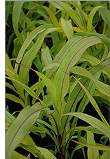
Jester Millet foliage