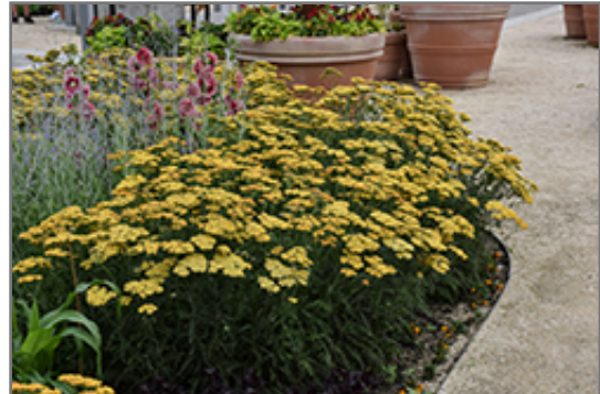
Terra Cotta Yarrow in bloom