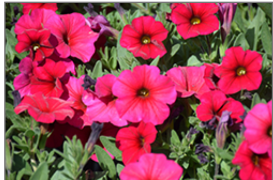
SuperCal Cherry Petchoa flowers

SuperCal Cherry Petchoa is recommended for the following landscape applications;