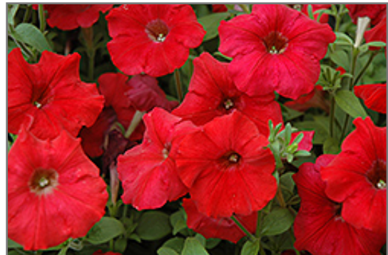
Easy Wave Red Petunia flowers

This plant will require occasional maintenance and upkeep. Trim off the flower heads after they fade and die to encourage more blooms late into the season. It is a good choice for attracting hummingbirds to your yard, but is not particularly attractive to deer who tend to leave it alone in favor of tastier treats. It has no significant negative characteristics.