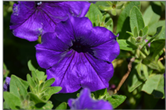
Easy Wave Blue Petunia flowers