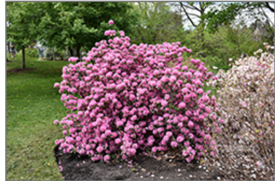
Aglo Rhododendron in bloom