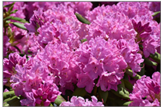
Roseum Elegans Rhododendron flowers