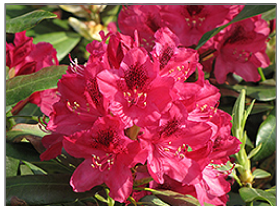
Nova Zembla Rhododendron flowers