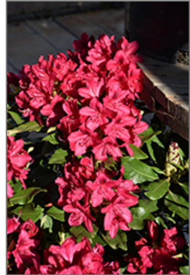
Nova Zembla Rhododendron flowers

This shrub does best in full sun to partial shade. You may want to keep it away from hot, dry locations that receive direct afternoon sun or which get reflected sunlight, such as against the south side of a white wall. It requires an evenly moist well-drained soil for optimal growth, but will die in standing water. It is very fussy about its soil conditions and must have rich, acidic soils to ensure success, and is subject to chlorosis (yellowing) of the foliage in alkaline soils. It is somewhat tolerant of urban pollution, and will benefit from being planted in a relatively sheltered location. Consider applying a thick mulch around the root zone in winter to protect it in exposed locations or colder microclimates. This particular variety is an interspecific hybrid.