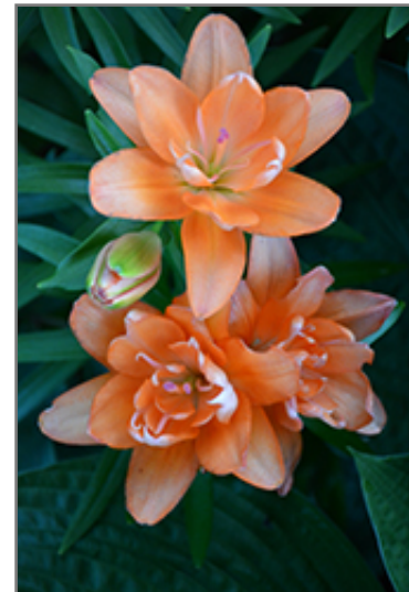
Lily Looks Tiny Double You Lily flowers