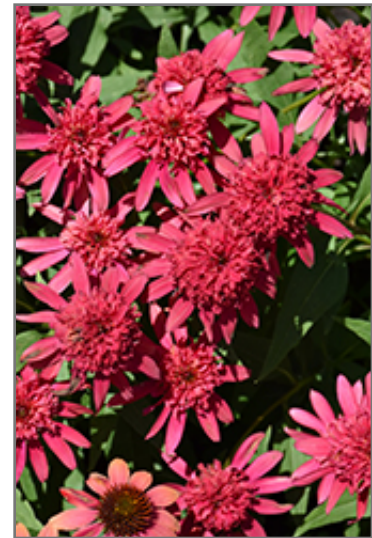
Double Scoop Raspberry Coneflower flowers