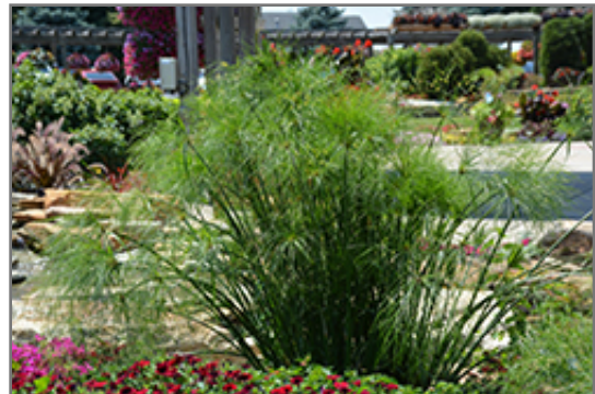
King Tut Egyptian Papyrus