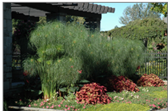
King Tut Egyptian Papyrus