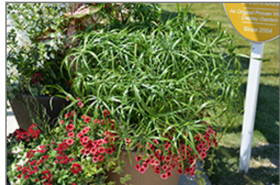
Baby Tut Umbrella Grass