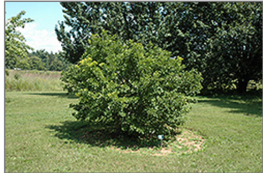
Jade Butterflies Ginkgo