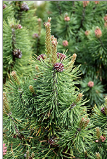
Big Tuna Mugo Pine foliage