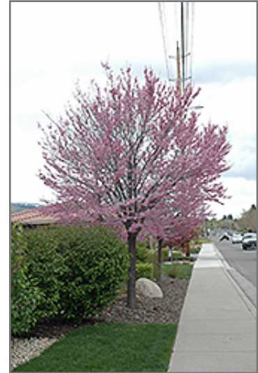
Eastern Redbud (tree form) in bloom

This tree does best in full sun to partial shade. It prefers to grow in average to moist conditions, and shouldn't be allowed to dry out. It is not particular as to soil type or pH. It is highly tolerant of urban pollution and will even thrive in inner city environments, and will benefit from being planted in a relatively sheltered location. Consider applying a thick mulch around the root zone in winter to protect it in exposed locations or colder microclimates. This is a selection of a native North American species.