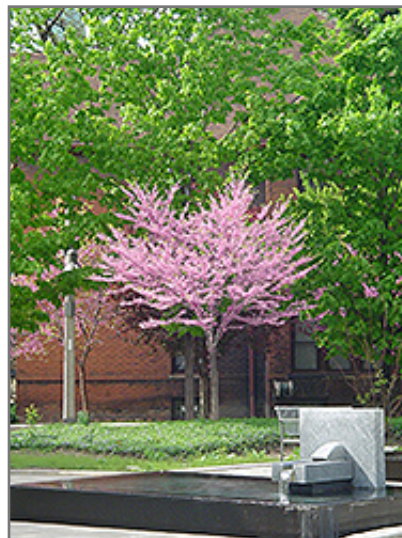
Eastern Redbud (tree form) in bloom