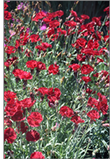
Fire Star Pinks flowers

Fire Star Pinks will grow to be about 8 inches tall at maturity, with a spread of 8 inches. When grown in masses or used as a bedding plant, individual plants should be spaced approximately 6 inches apart. Its foliage tends to remain low and dense right to the ground. It grows at a medium rate, and under ideal conditions can be expected to live for approximately 10 years. As an evergreen perennial, this plant will typically keep its form and foliage year-round.