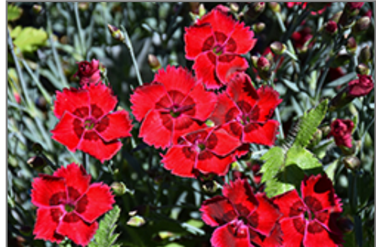
Fire Star Pinks flowers

This is a relatively low maintenance plant, and is best cleaned up in early spring before it resumes active growth for the season. It is a good choice for attracting bees and butterflies to your yard, but is not particularly attractive to deer who tend to leave it alone in favor of tastier treats. It has no significant negative characteristics.