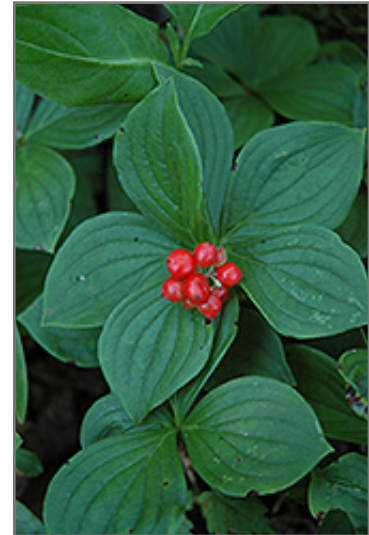
Bunchberry fruit