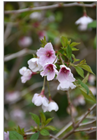
Kojo No Mai Fuji Cherry flowers