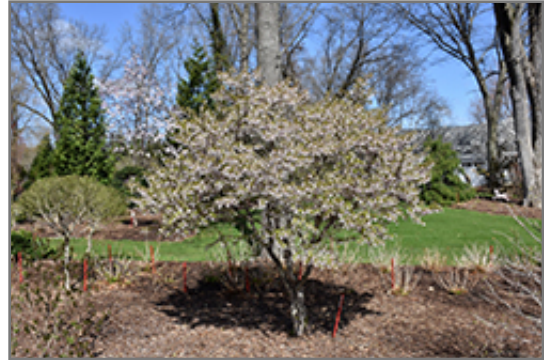
Kojo No Mai Fuji Cherry in bloom