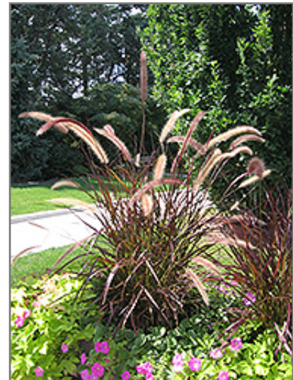
Purple Fountain Grass flowers

Purple Fountain Grass is recommended for the following landscape applications;