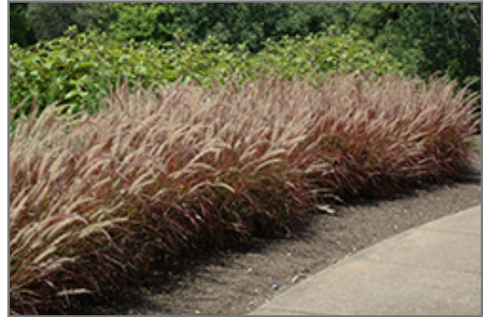
Purple Fountain Grass in bloom

Purple Fountain Grass is a fine choice for the garden, but it is also a good selection for planting in outdoor pots and containers. Because of its height, it is often used as a 'thriller' in the 'spiller-thriller-filler' container combination; plant it near the center of the pot, surrounded by smaller plants and those that spill over the edges. It is even sizeable enough that it can be grown alone in a suitable container. Note that when growing plants in outdoor containers and baskets, they may require more frequent waterings than they would in the yard or garden.