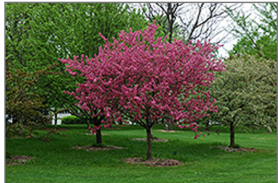
Prairifire Flowering Crab in bloom

Prairifire Flowering Crab is recommended for the following landscape applications;