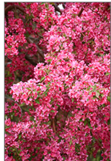
Prairifire Flowering Crab flowers