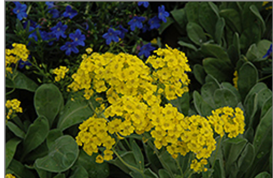
Basket Of Gold Alyssum flowers