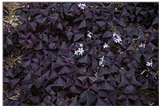
Purple Shamrock foliage