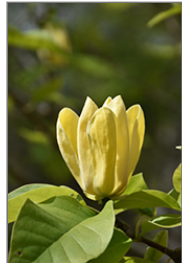
Yellow Bird Magnolia flowers