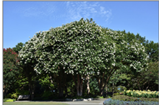
Natchez Crapemyrtle in bloom