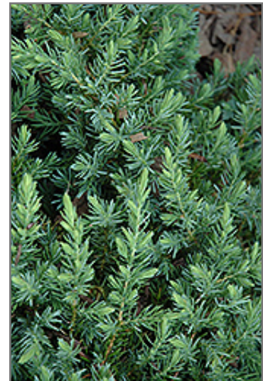
Blue Pacific Shore Juniper foliage