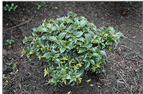
Rock Garden Holly