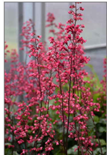
Paris Coral Bells flowers