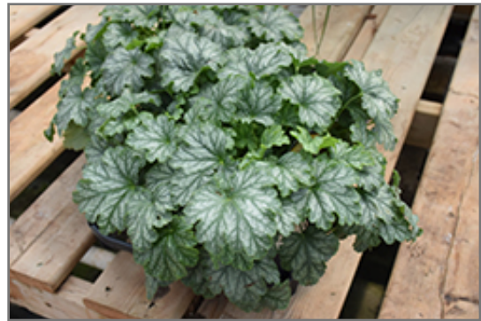
Paris Coral Bells foliage

Paris Coral Bells will grow to be about 8 inches tall at maturity extending to 14 inches tall with the flowers, with a spread of 14 inches. When grown in masses or used as a bedding plant, individual plants should be spaced approximately 12 inches apart. Its foliage tends to remain low and dense right to the ground. It grows at a medium rate, and under ideal conditions can be expected to live for approximately 10 years. As an evergreen perennial, this plant will typically keep its form and foliage year-round.