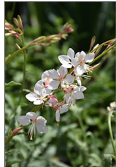
Whirling Butterflies Gaura flowers

This is a relatively low maintenance plant, and is best cleaned up in early spring before it resumes active growth for the season. It is a good choice for attracting butterflies to your yard, but is not particularly attractive to deer who tend to leave it alone in favor of tastier treats. It has no significant negative characteristics.