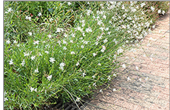
Whirling Butterflies Gaura in bloom