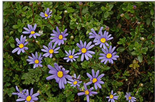
Blue Daisy flowers