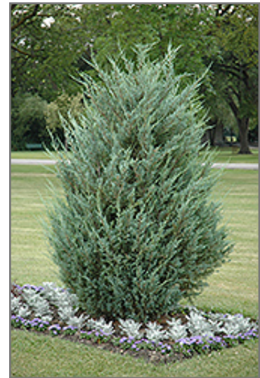
Moonglow Juniper