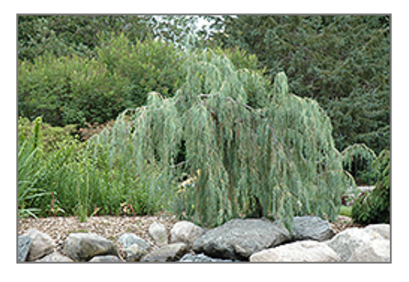
Tolleson's Weeping Juniper

Tolleson's Weeping Juniper is recommended for the following landscape applications;