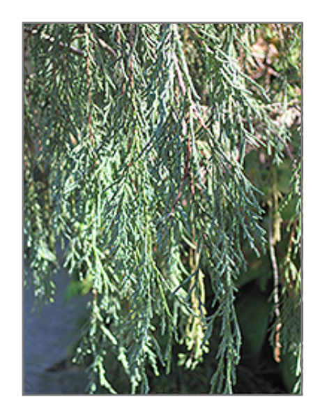
Tolleson's Weeping Juniper foliage

This shrub should only be grown in full sunlight. It is very adaptable to both dry and moist growing conditions, but will not tolerate any standing water. It is considered to be drought-tolerant, and thus makes an ideal choice for xeriscaping or the moisture-conserving landscape. It is not particular as to soil type or pH. It is somewhat tolerant of urban pollution. This is a selection of a native North American species.