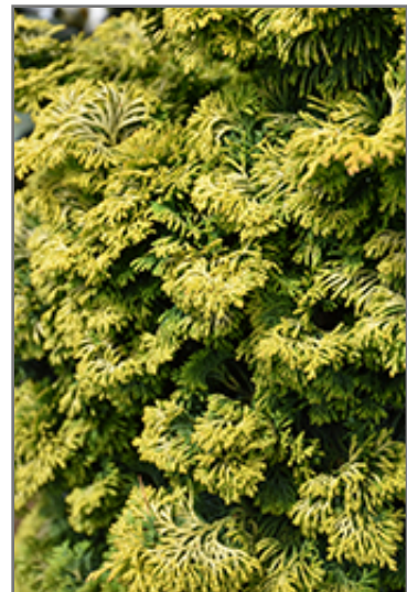
Dwarf Golden Hinoki Falsecypress foliage