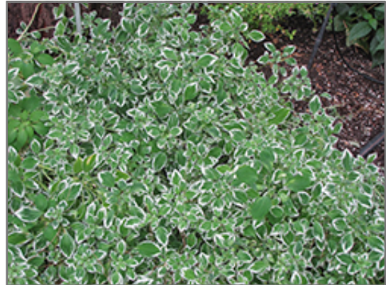
Variegated Parrot Feather