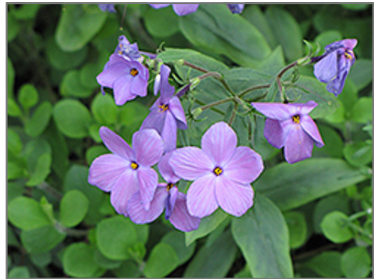
Sherwood Blue Woodland Phlox flowers