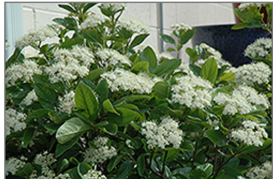
Winterthur Viburnum flowers

This is a relatively low maintenance shrub, and should only be pruned after flowering to avoid removing any of the current season's flowers. It is a good choice for attracting birds to your yard, but is not particularly attractive to deer who tend to leave it alone in favor of tastier treats. It has no significant negative characteristics.