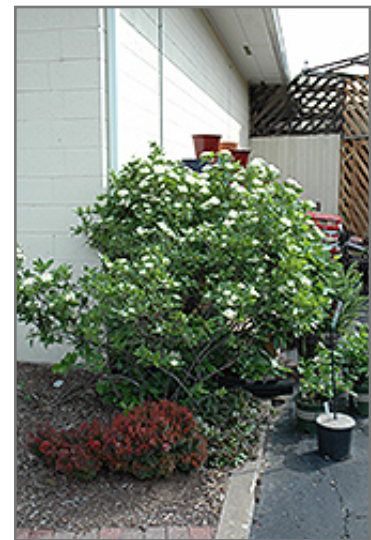
Winterthur Viburnum in bloom