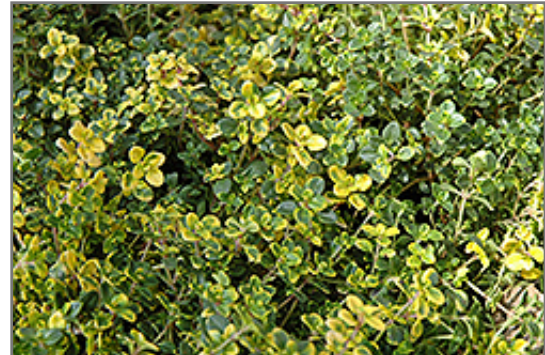
Doone Valley Thyme