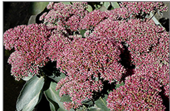
Autumn Delight Stonecrop flowers

This is a relatively low maintenance plant, and is best cleaned up in early spring before it resumes active growth for the season. It is a good choice for attracting butterflies to your yard, but is not particularly attractive to deer who tend to leave it alone in favor of tastier treats. It has no significant negative characteristics.