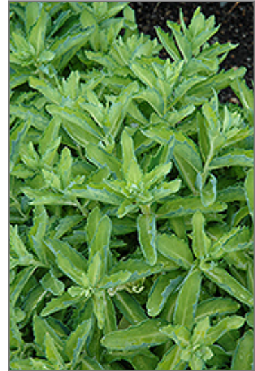
Autumn Delight Stonecrop foliage

Autumn Delight Stonecrop is a fine choice for the garden, but it is also a good selection for planting in outdoor pots and containers. It is often used as a 'filler' in the 'spiller-thriller-filler' container combination, providing a mass of flowers and foliage against which the larger thriller plants stand out. Note that when growing plants in outdoor containers and baskets, they may require more frequent waterings than they would in the yard or garden.