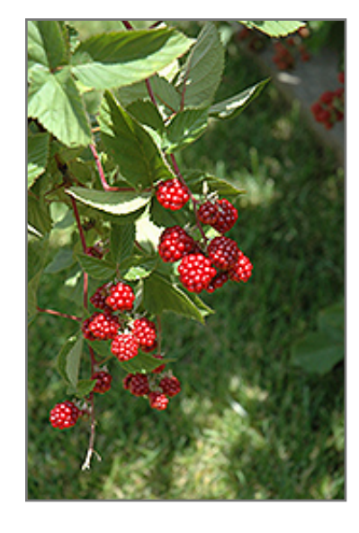
Heritage Raspberry fruit

Heritage Raspberry has rich green deciduous foliage on a plant with an upright spreading habit of growth. The fuzzy oval compound leaves do not develop any appreciable fall color. It features an abundance of magnificent red berries from early summer to early fall.