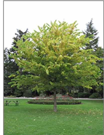
Common Hackberry in fall