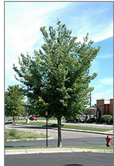
Common Hackberry